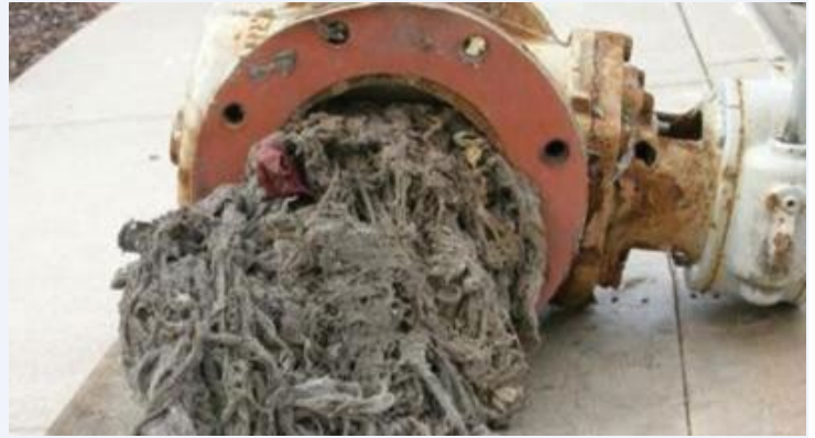
A mass of flushable and disinfectant wipes clogs a pipe.

If a personal sewer lateral backs up, it is the property owner's responsibility and can be very costly.